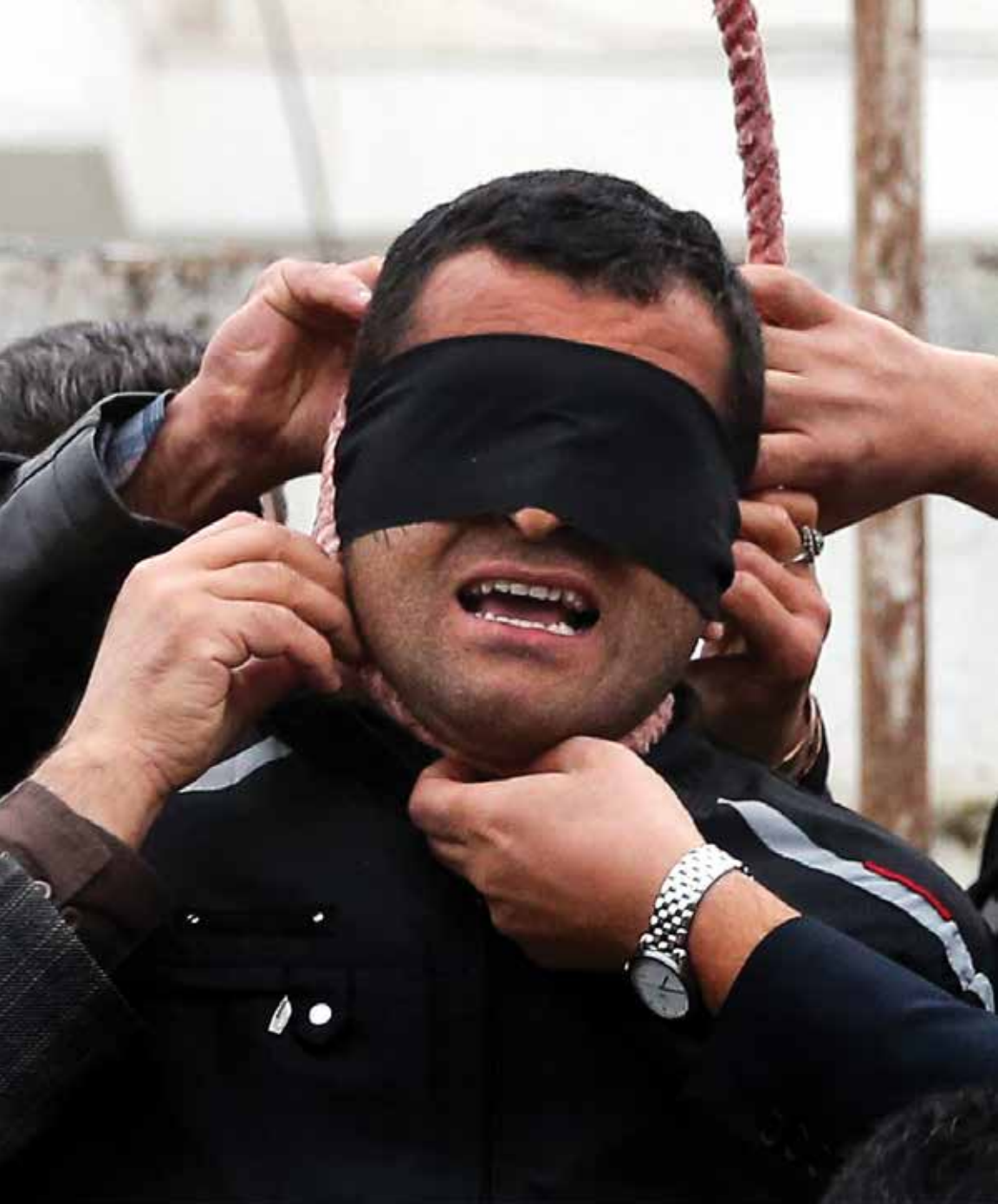
Parents of victim granting mercy to convicted murderer by removing the rope from around his neck and halting the execution at the last minute.