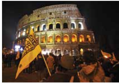
The Colosseum is illuminated with the 'Cities of Life' logo to support the campaign against the death penalty, in Rome, Italy, 30 November 2011.

Amnesty International and others helped us establish contacts with many panellists whose contributions are included in this book. The Governments of Chile, Italy and the Philippines co-organised events with us, and the Government of Italy contributed financially to the production of this publication.