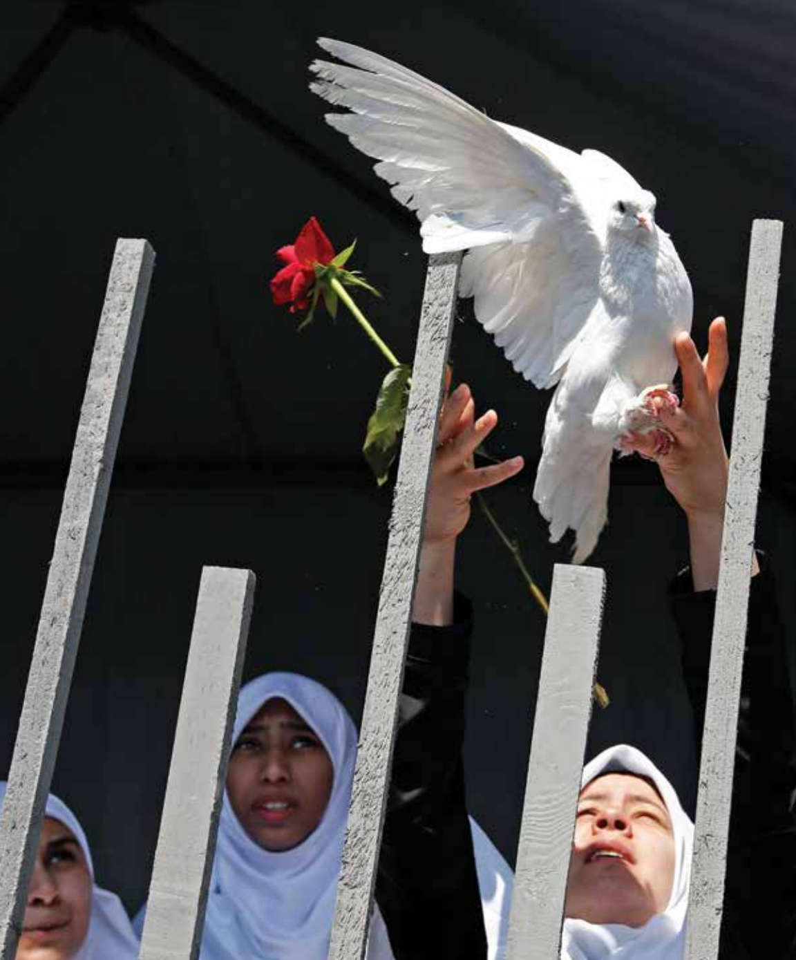
Peaceful protesters against the death penalty.