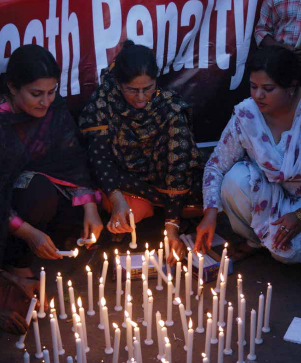
Human rights activists light candles in observance of the World Day against the Death Penalty.