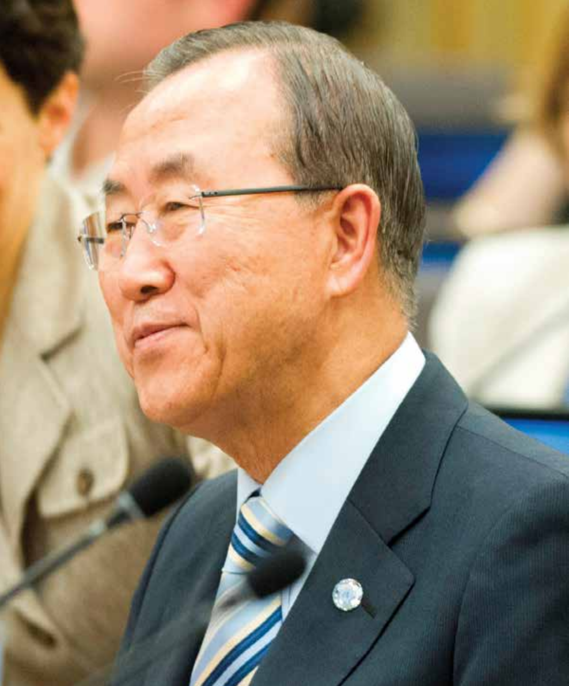
United Nations Secretary-General Ban Ki-moon attending OHCHR's global panel: "Moving away from the death penalty – wrongful convictions", New York, 28 June 2013