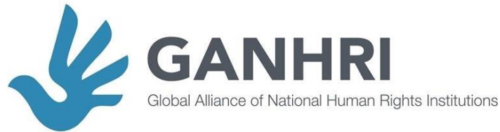
CHART OF THE STATUS OF NATIONAL INSTITUTIONS