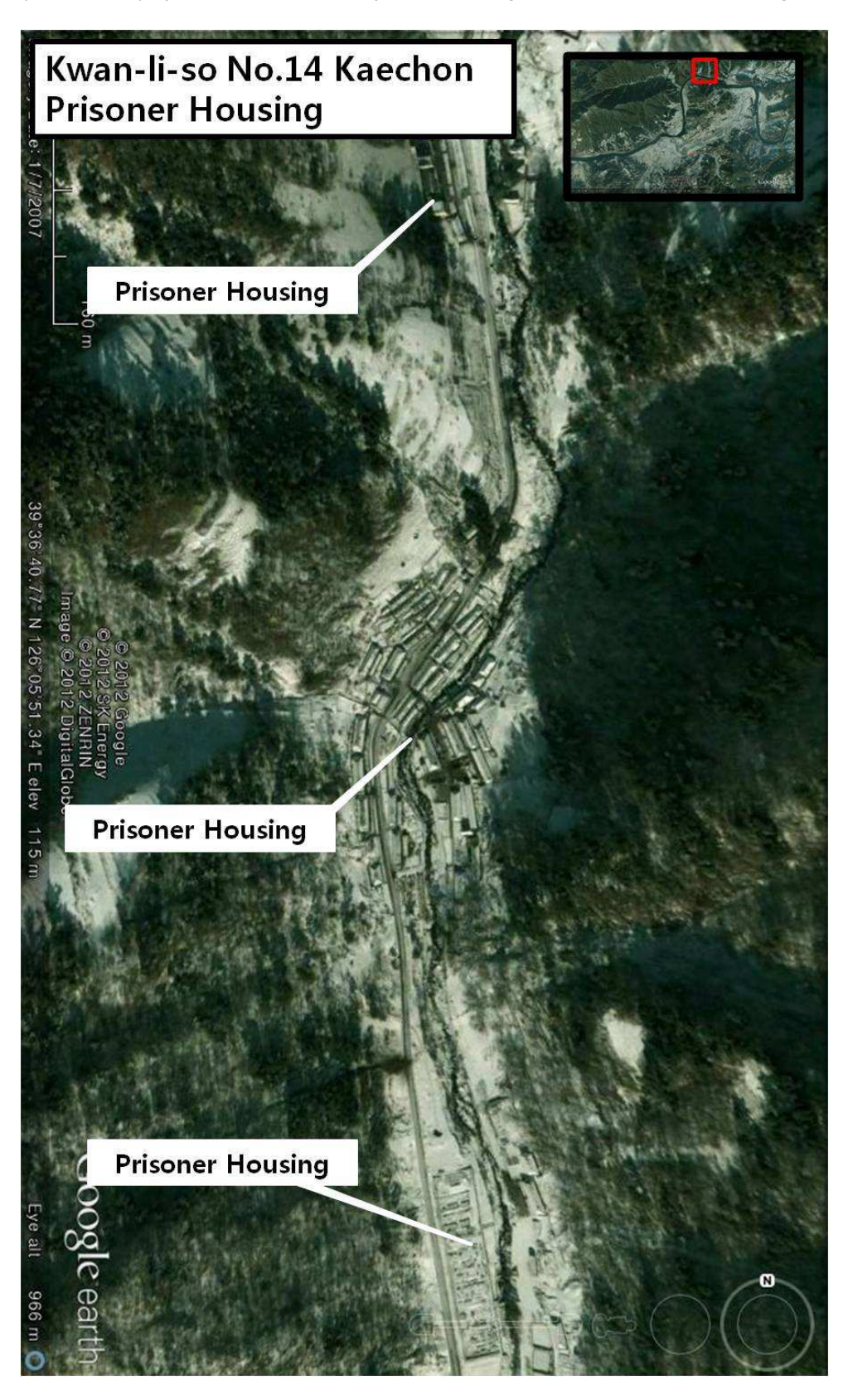
Political Prison Camp No. 14, Kaechon County, South Pyongang – Prisoner Housing Analysis