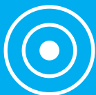
FALLS WITHIN 7M AWAY FROM TARGET