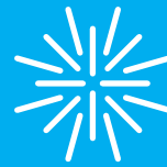
2000 LETHAL FRAGMENTS PROJECTED

THE IDF SAID AT LEAST 34,000 ARTILLERY SHELLS WERE FIRED INTO GAZA IN 2014 – A DAILY AVERAGE OF 680 ARTILLERY SHELLS FIRED INTO GAZA BY THE IDF.