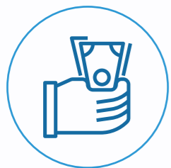
Corruption Perception Index 2018 (Transparency International, 2019)

Survey results show that widespread corruption and ineffective laws and regulations are the greatest concerns for business leaders across ASEAN.