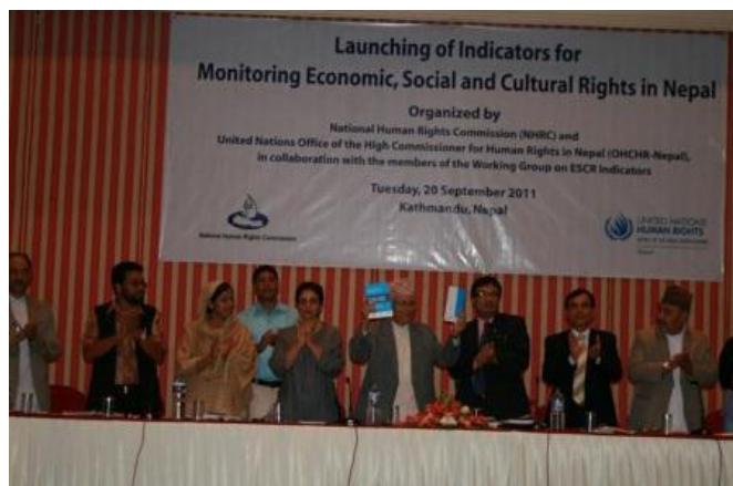
NHRC Chairperson launching the User's Guide

On 20 September, the National Human Rights Commission and OHCHR-Nepal launched A User's Guide containing indicators for selected economic, social and cultural rights (ESCR) in Nepal. Based on the OHCHR framework and developed by the Working Group on ESCR Indicators, which also included National Women Commission, National Dalit Commission, Ministry of Health and Population and Community Self-Reliance Centre, the indicators are expected to serve as a tool for the national stakeholders to monitor progressive realisation of the rights to adequate food, adequate housing, health, education and work. The Government's National Human Rights Action Plan (2010), which outlines national human rights priorities for the next three years, has already integrated some of these indicators.