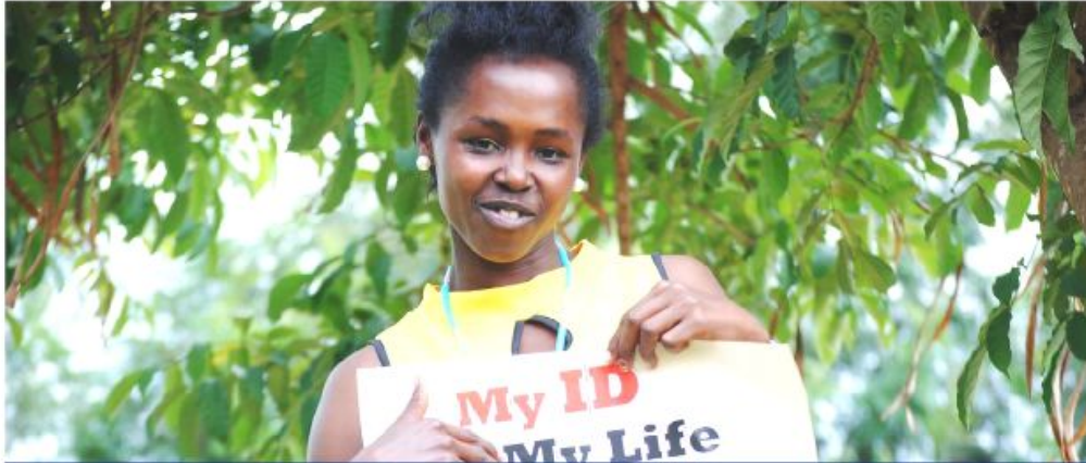
The K-YES "My ID, My Life" campaign helps young people register for national identification cards. Without these cards, youth cannot open a bank account, register a business, access higher education or obtain formal employment.