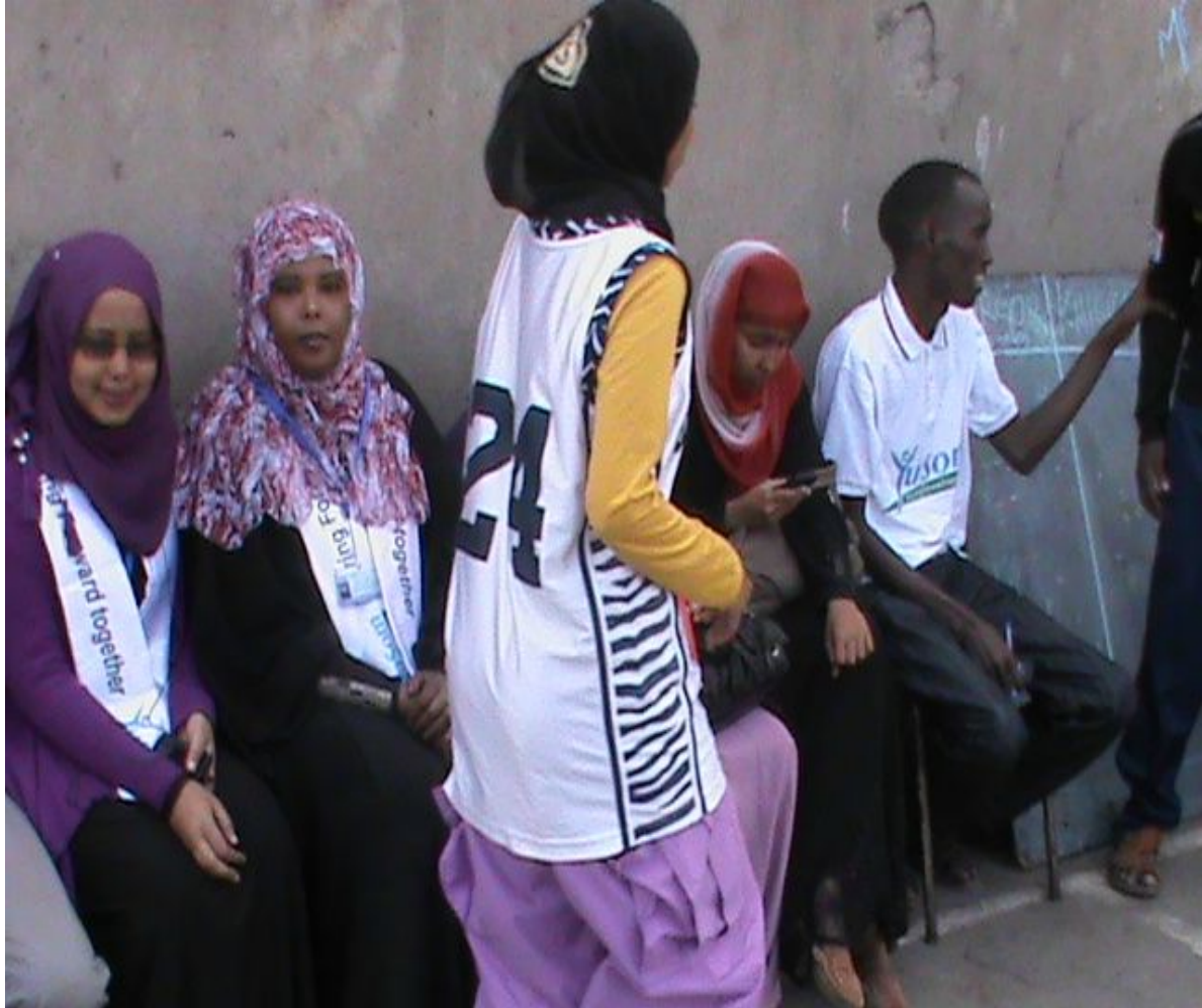
Hundreds of girls attended at the YUSOM girls' empowerment basketball games in Eastliegh, click for more