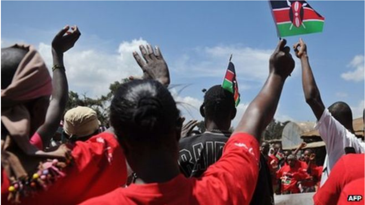
Youths attend a peace demonstration in Kibera slum, Nairobi, ahead of the poll