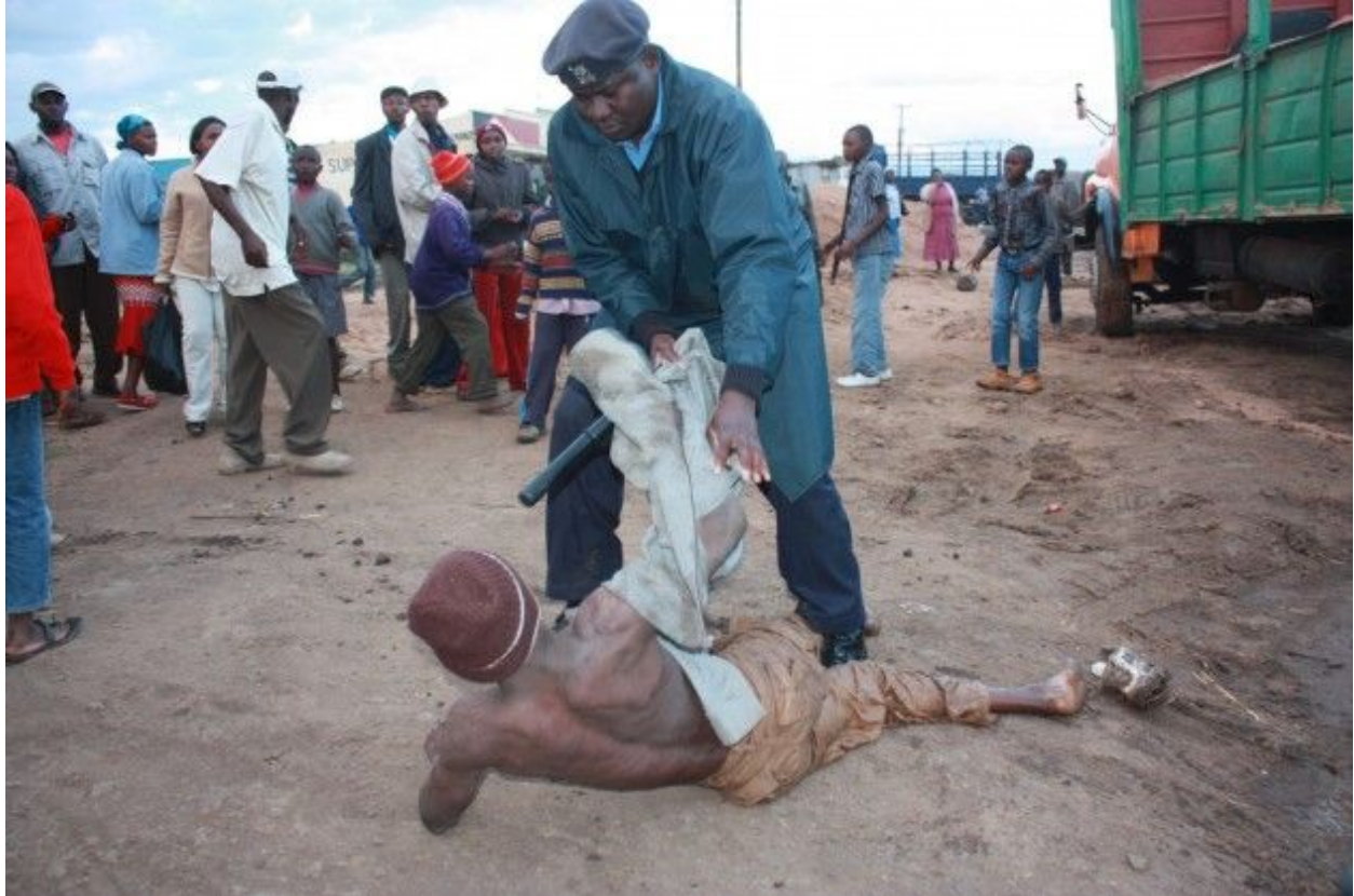
A crowd gathers to watch an intoxicated youth as a police officer c Kenya.