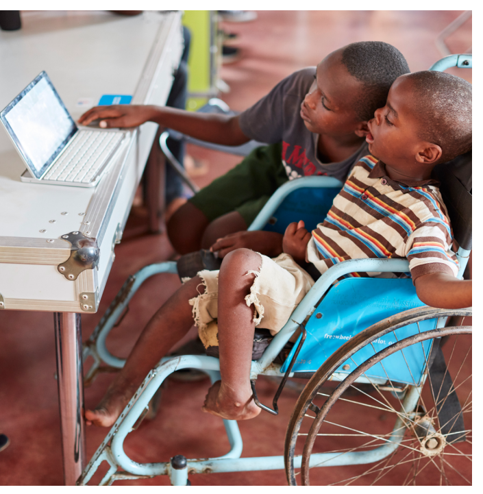
RWANDA - Youth centre Mahama-camp, HI project

A number of policy frameworks and international human rights instruments seek to ensure equitable access