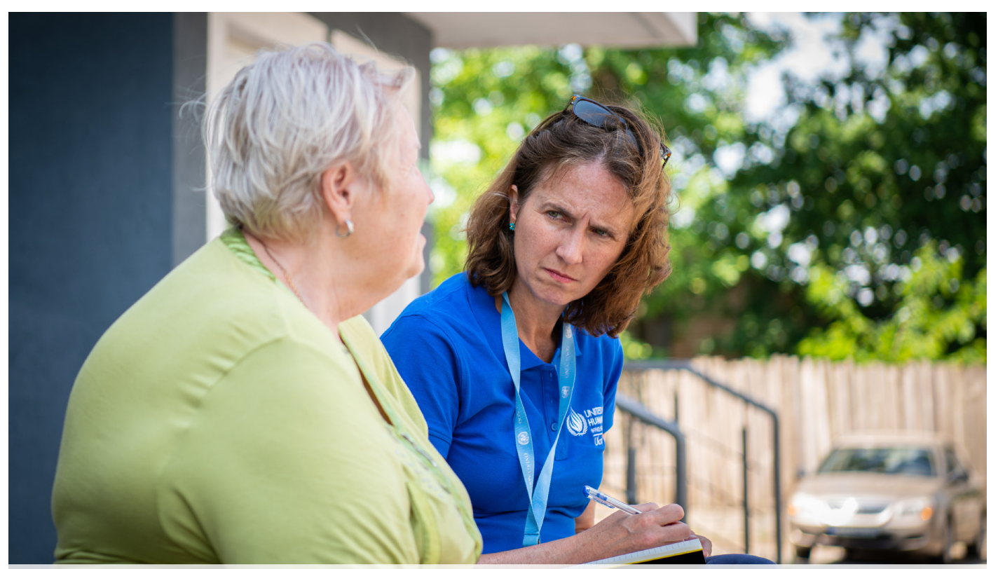
A woman interviewed by HRMMU in Irpin, Kyiv region, where many human rights violations were perpetrated by Russian armed forces in February and March 2022.