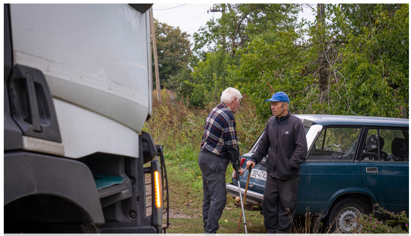
Two older men residing in Vysokopillya, Kherson region, a village controlled by Russian armed forces until September 2022.

families being separated and people being unable to collect their Ukrainian social security allowances and pensions. Civilians wishing to travel from the occupied parts of Zaporizhzhia, Kherson, Donetsk and Luhansk regions to the territory of Ukraine under Government control could only do so through the Russian Federation. The trip is not only expensive (around US$400 per person), but it also involves going through a so-called 'filtration' process, a system of security checks and personal data collection that has led to individuals being arbitrarily detained. HRMMU also documented many cases of men and women who were arbitrarily detained or forcibly disappeared by the Russian occupation authorities while trying to cross the administrative boundary line between mainland