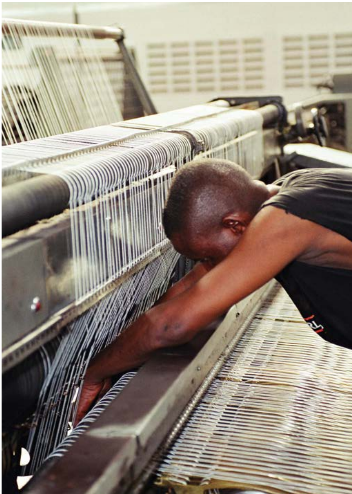
An Indian enterprise producing fishing nets in the suburbs of Dar Es Saalam.