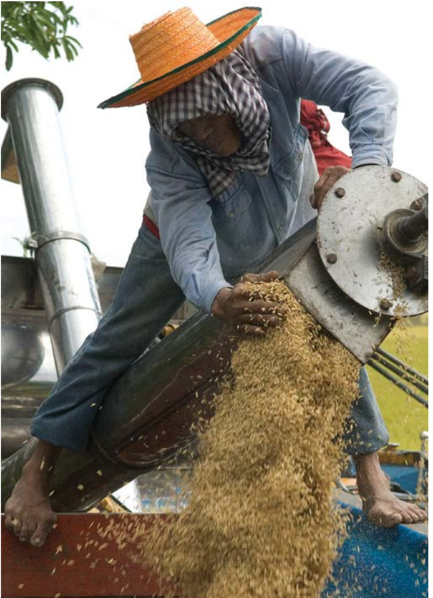
Rice being transferred from a combine harvester to a truck, Thailand.