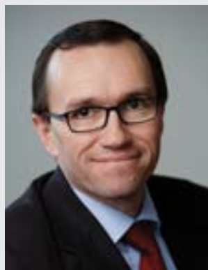
Utenriksminister Espen Barth Eide

We wish you success in your efforts to promote sustainable business practice.