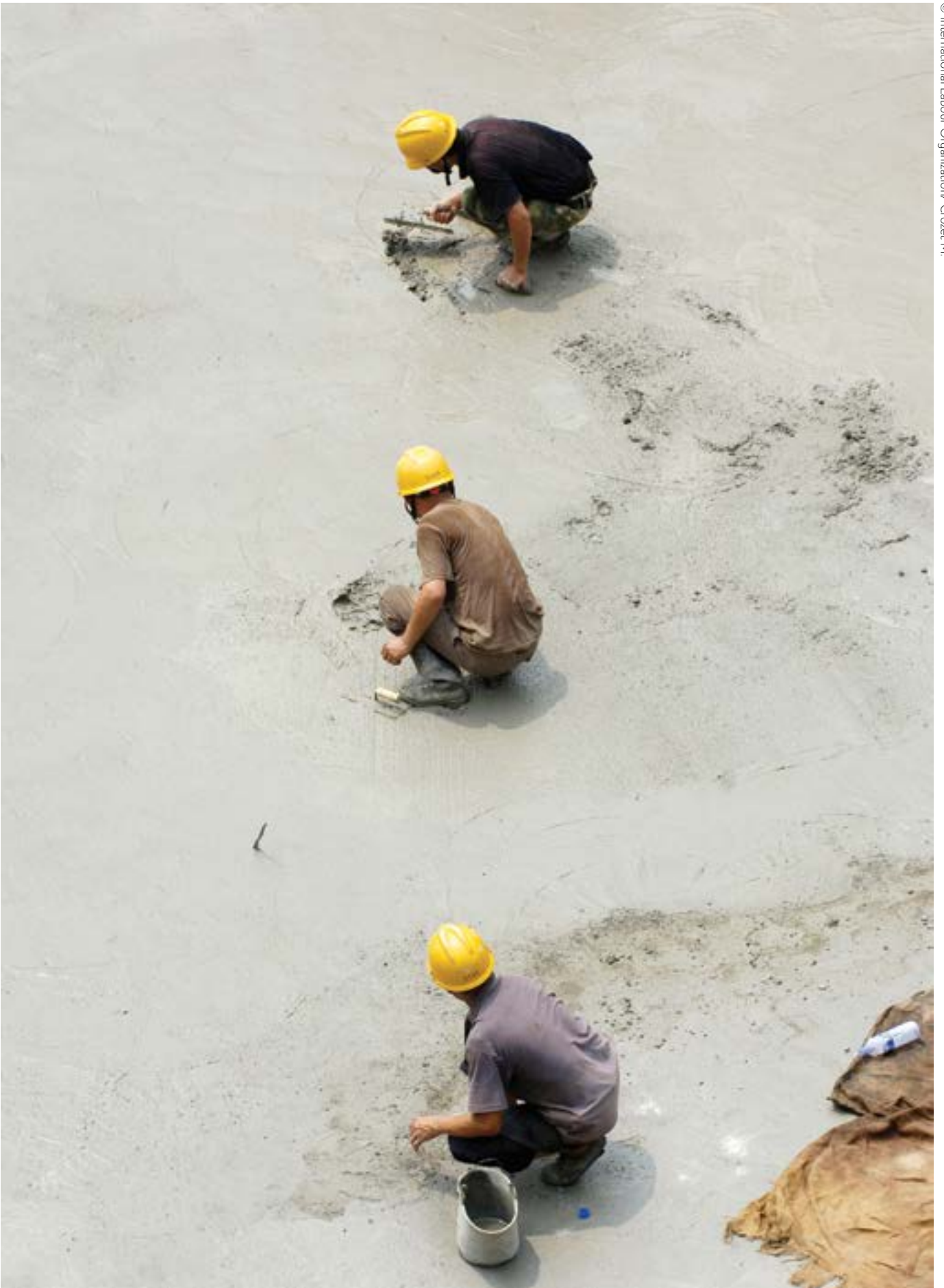
Masons on a construction site, Chendu, China