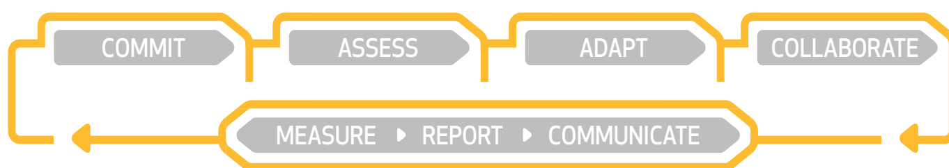
Fig. 2 A structured approach to ethical trade, IEH - Ethical Trading Initiative Norway

The human rights due diligence process outlined in this guide is based on the Respect pillar of the UN “Protect, Respect, Remedy” framework 3 . The process focuses on how to prevent, mitigate and remedy negative impacts on people working in supply chains, and the local communities in which they live and work, through adopting a risk-based approach.