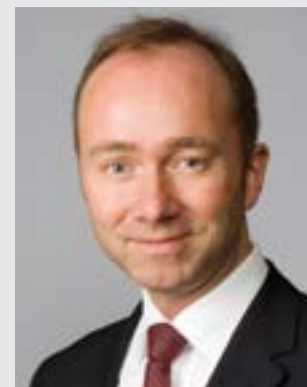
Nærings- og handelsminister Trond Giske

By: IEH- Ethical Trading Initiative Norway, with funding from the Ministry of Foreign Affairs. IEH is a resource centre and an advocate for ethical trade practices. IEH is a part of the Norwegian Government's consultative body on matters relating to CSR (KOMpakt).