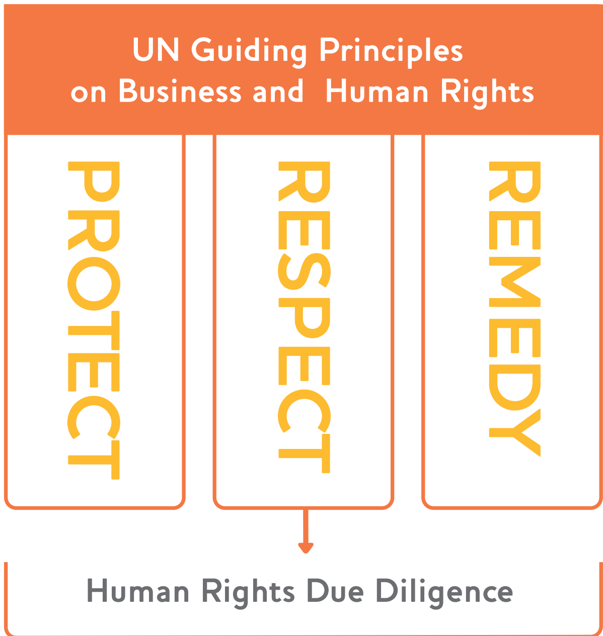
Fig. 1 Human rights due diligence as part of the UN “Protect, Respect, Remedy” framework