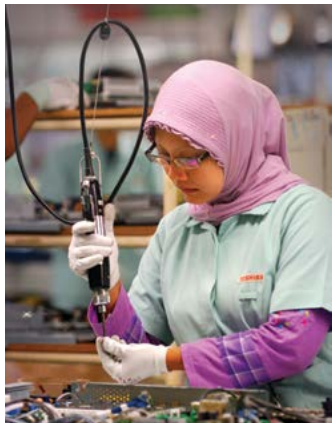
Worker assembling and manufacturing of electronic goods, Indonesia.

Human rights due diligence should be integrated into core business and decision-making processes, including sourcing and purchasing. Opposite is a case that illustrates how Varner Group, a Norwegian clothes retailer, has integrated due diligence into its sourcing procedures.