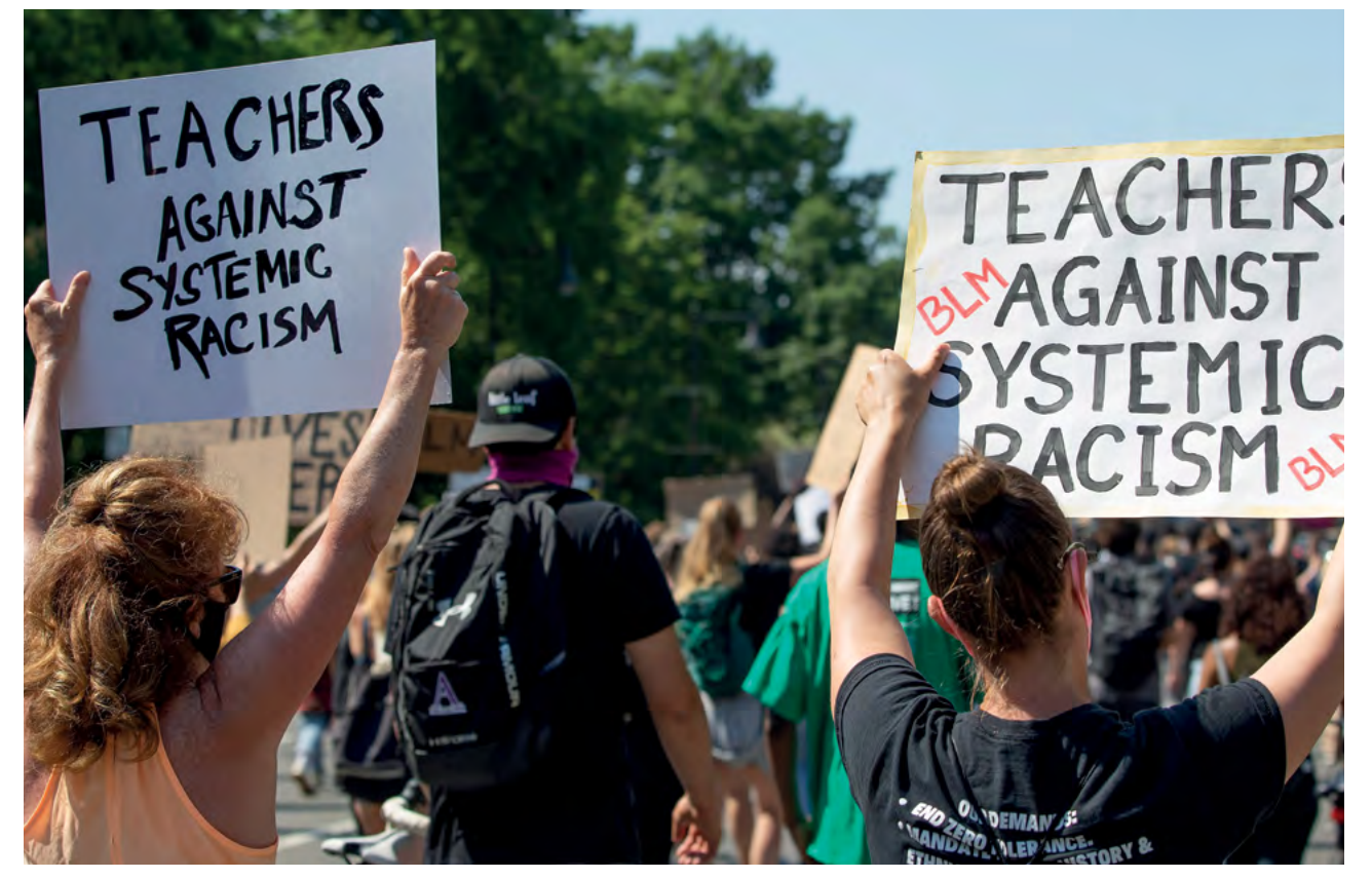
Protesters hold signs urging an end to systemic racism during a march in honor of the new United States national Juneteenth holiday in Galveston, Texas, USA

See more here on international mandates and efforts to eliminate racism: https://spinternet.ohchr.org/ ViewAllCountryMandates.aspx?Type=TM&lang=e