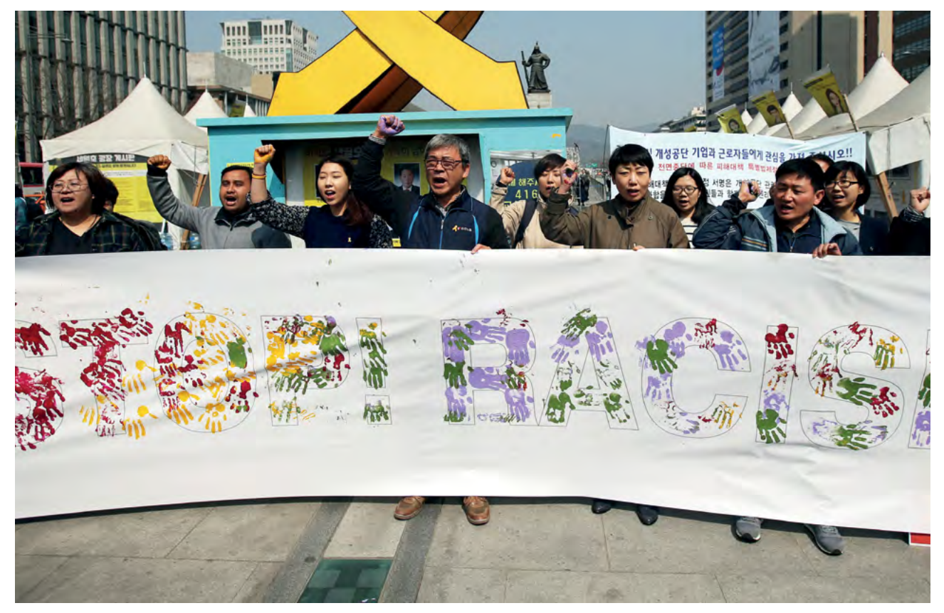
Members of rights groups for migrant workers, holding a sign saying "Stop! Racism," attend a protest rally at a plaza in downtown Seoul, South Korea.