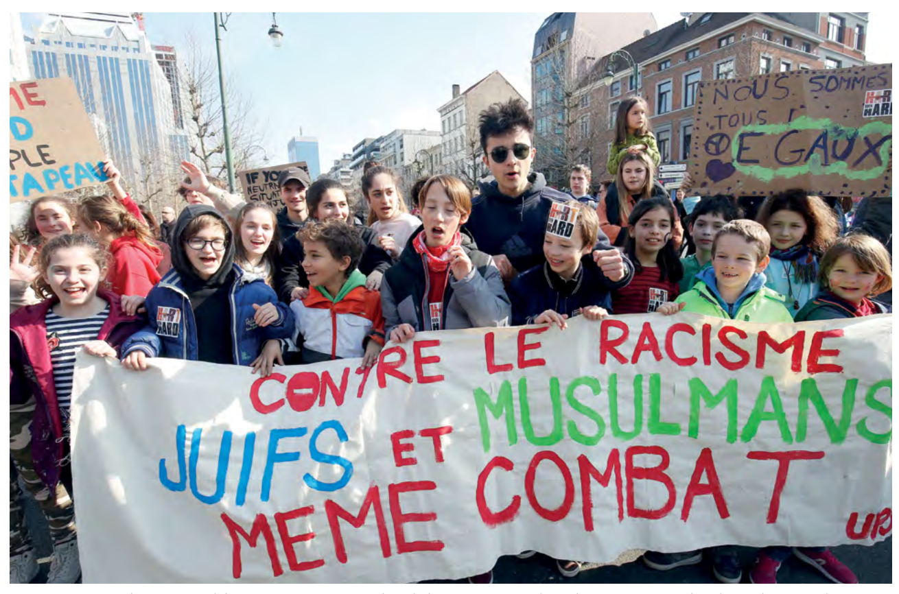
Demonstrators protest during a national demonstration against racism, hatred, discrimination, inequality and aggression in Brussels, Belgium. The sign reads "Against Racism/ Jews and Muslims/ same fight."