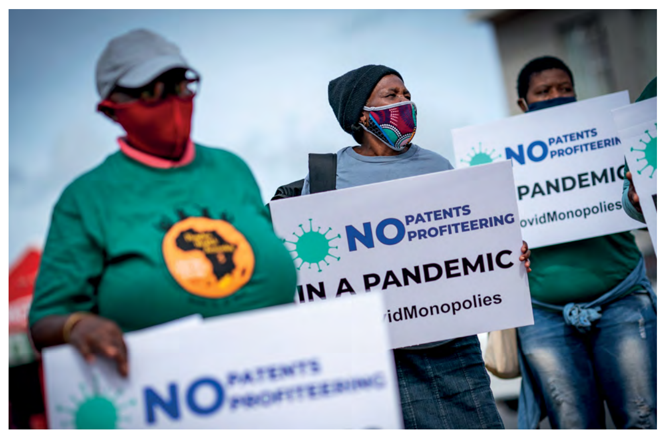
Members of the People's Vaccine Campaign of South Africa protest equal access and fair prices for COVID 19 vaccines.