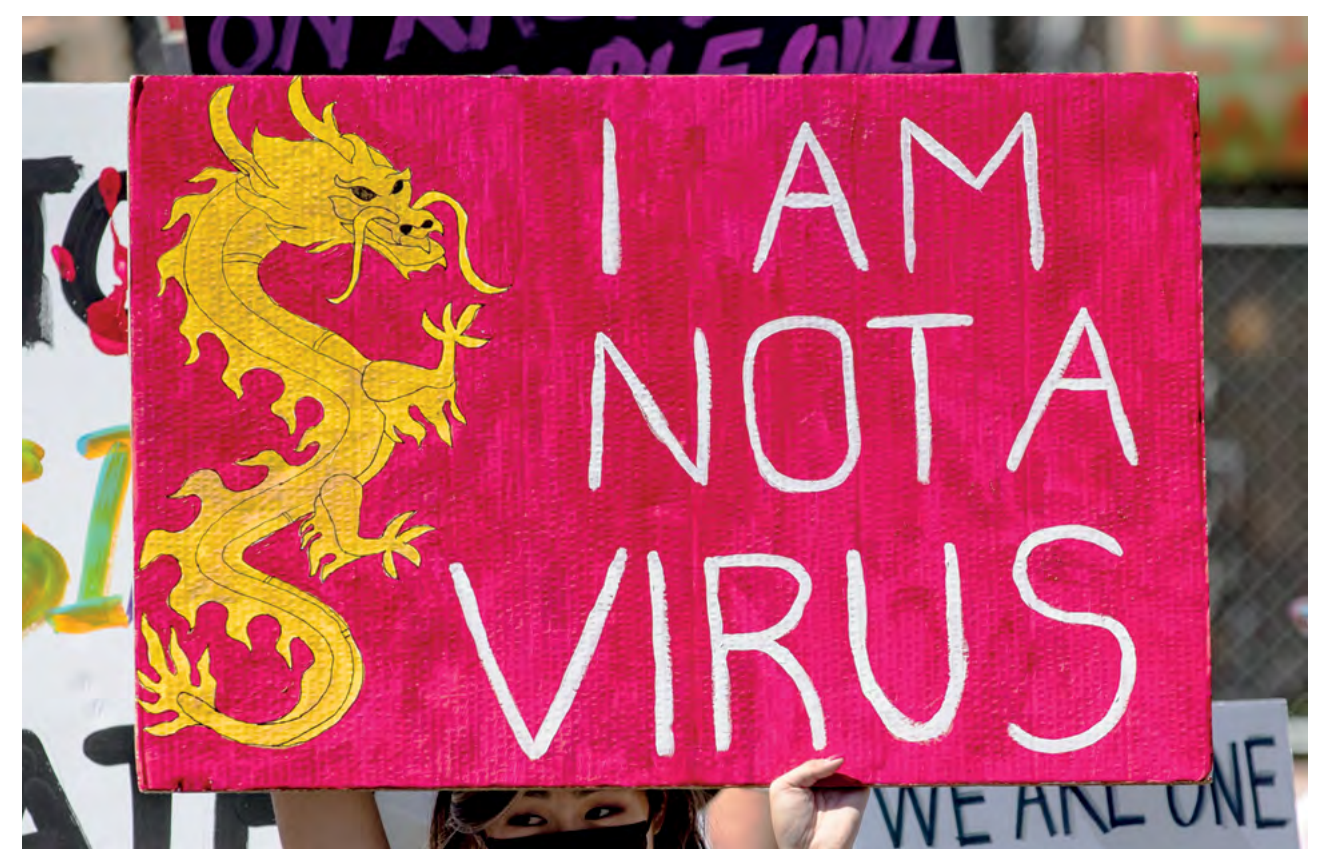
A demonstrator holds a poster reading: I am not a virus, during anti-Asian hate protests in Los Angeles, California, USA.