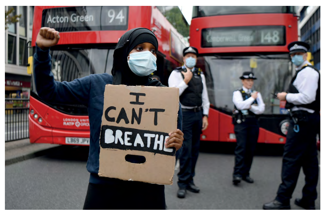
A 'Black Lives Matter' protester wearing a face mask holds a placard in Notting Hill in London, Britain.