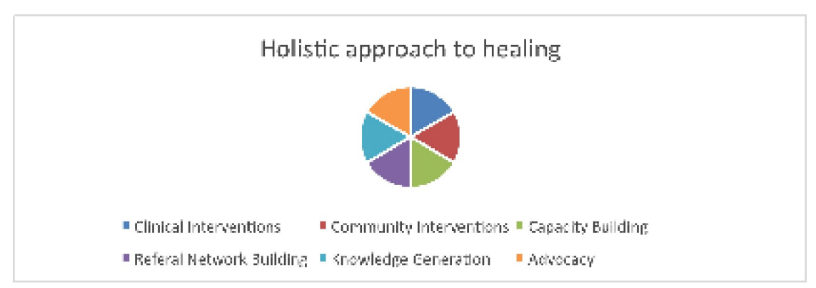
The Centre for the Study of Violence and Reconciliation

Throughout the workshop, participants drew attention to the need to undertake a holistic approach to assess victims' needs and to effectively coordinate interdisciplinary responses to support survivors. A holistic approach should: