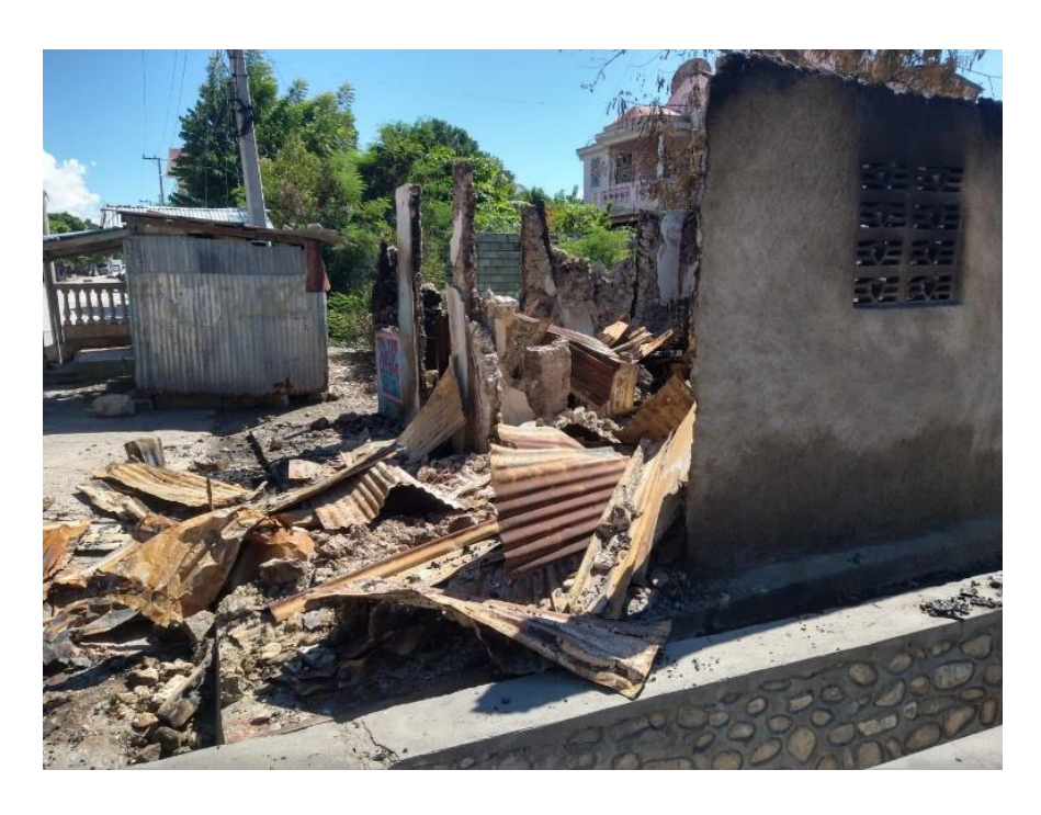
One of many houses destroyed on October 22, during an attack by members of the Grand Grif gang on the town center of the Petit Rivière de l'Artibonite commune.