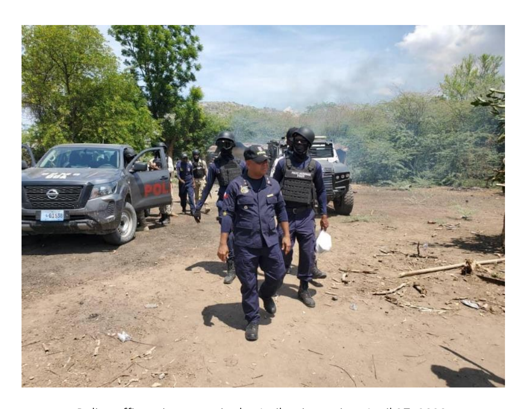
Police officers in a town in the Artibonite region, April 27, 2023

In June 2023, at a meeting with the HRS, HNP officials in Artibonite, despite the presence of these various units, felt that they did not have the operational and human resources needed to restore order and dismantle gangs. As a result, the police were content to simply patrol the main roads in the Artibonite valley and position themselves at strategic crossroads throughout the day. At the end of August 2023, the Director of the Artibonite Departmental Police was replaced. He had been appointed in January 2023, following the attack on police officers in Liancourt, his predecessor having been suspended from his duties and assigned to the HNP General Directorate.