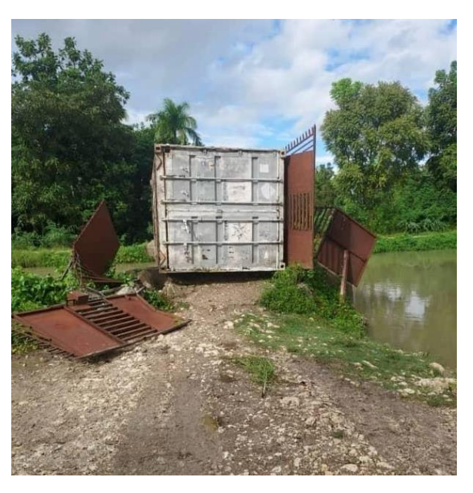
Residents of the commune of Liancourt have placed a container across a road leading to the commune of Liancourt, to prevent gang members from invading the area.

The number of people killed as a result of these abuses has reached extremely