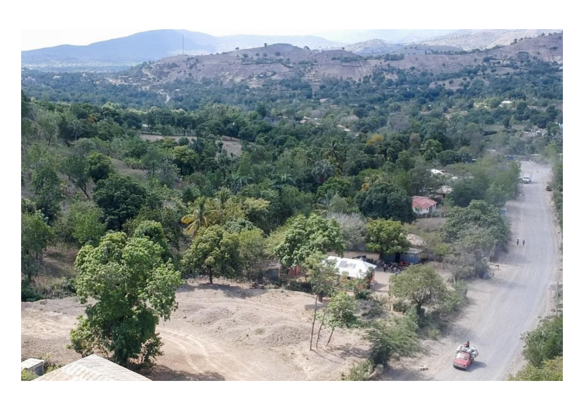
Gros Morne, a commune in the Artibonite departement

This region, which is likely to exert political and economic pressure on the capital and the country as a whole, has seen various forms of violence in its history. It has also been at the origin of protest movements that have destabilized the powers that be, in particular in 1986 against Duvalier, and again in 2004 against Aristide.