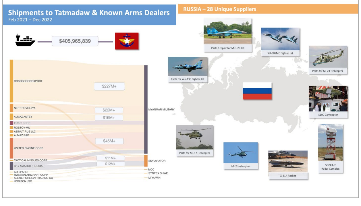
Figure 3: Highlighting major Russian companies, values, and types of equipment being supplied to the Myanmar military and Myanmar-based military suppliers between February 2021 and December 2022.

Figure 2: Russian companies supplying the Myanmar military and Myanmar-based military suppliers between February 2021 to December 2022.