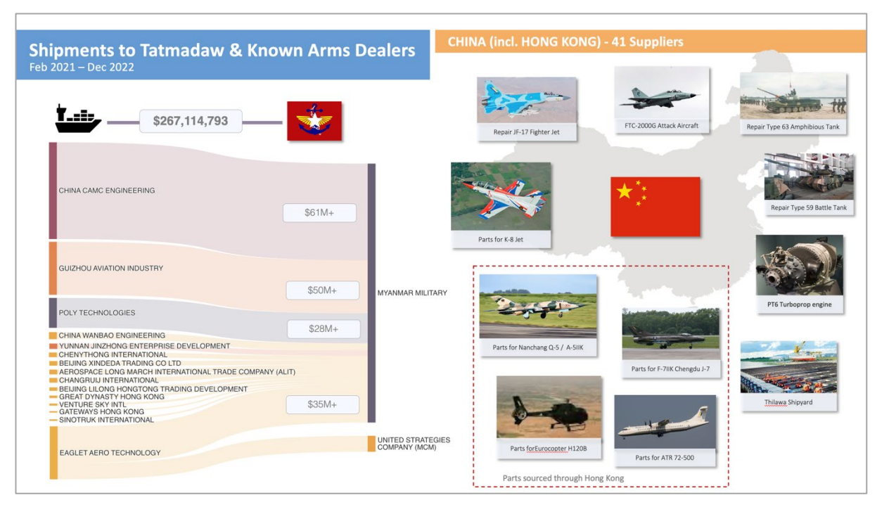
Figure 6: Highlighting major Chinese companies, values, and types of equipment being supplied to the Myanmar military and Myanmar-based military suppliers between February 2021 to December 2022.