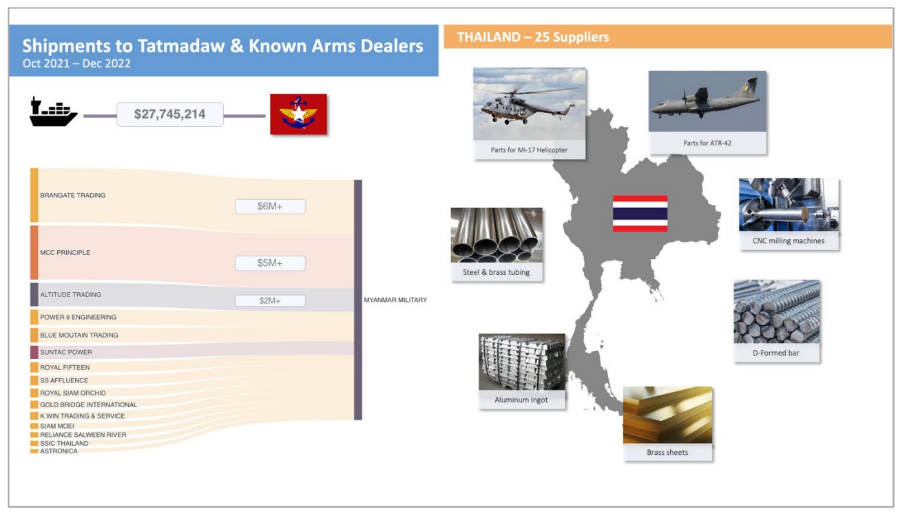
Figure 12: Visual representation of the types of equipment being supplied to the Myanmar military from Thai-based entities between October 2021 to December 2022