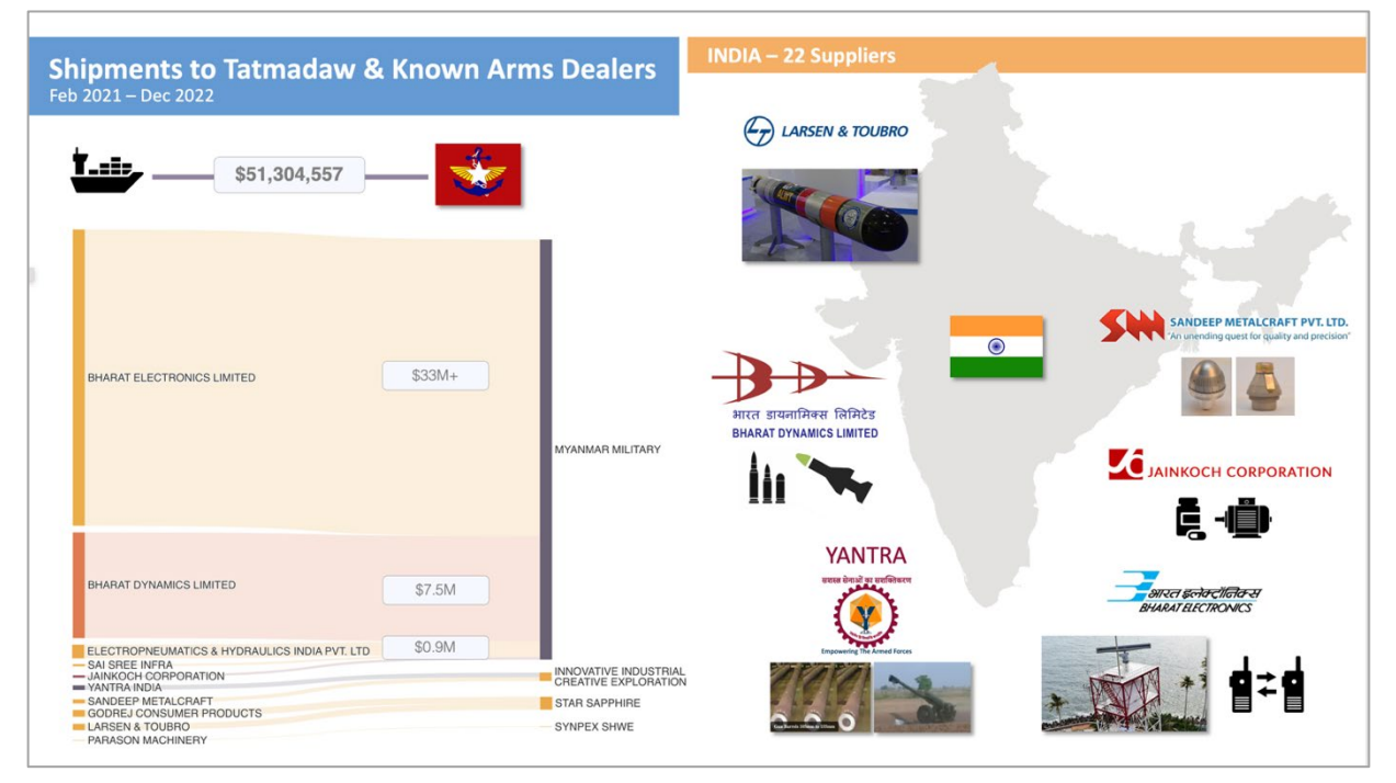
Figure 14: Visual representation of the companies supplying arms and equipment to the Myanmar military and Myanmar-based miliary suppliers from February 2021 to December 2022.

Figure 13: India companies supplying the Myanmar military and Myanmar-based miliary suppliers February 2021 to December 2022