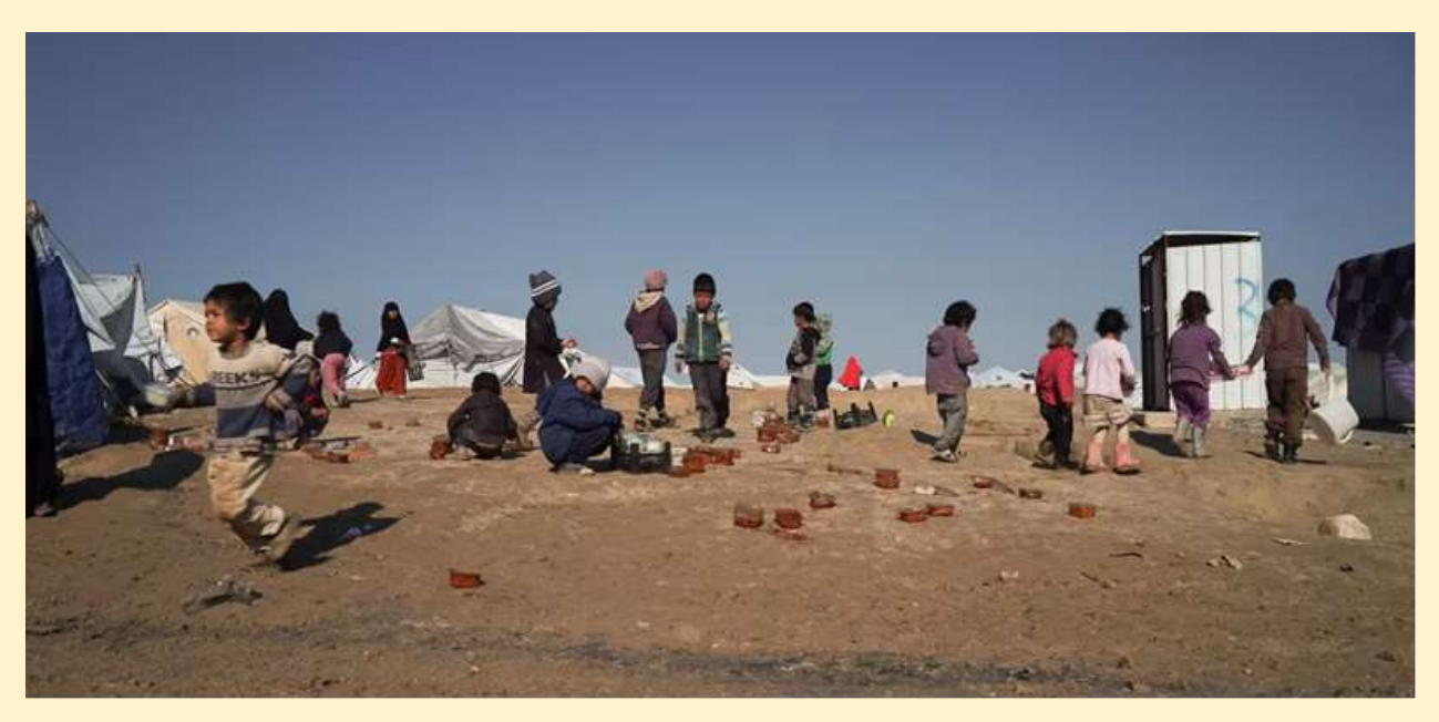
Children in Al Hawl Camp